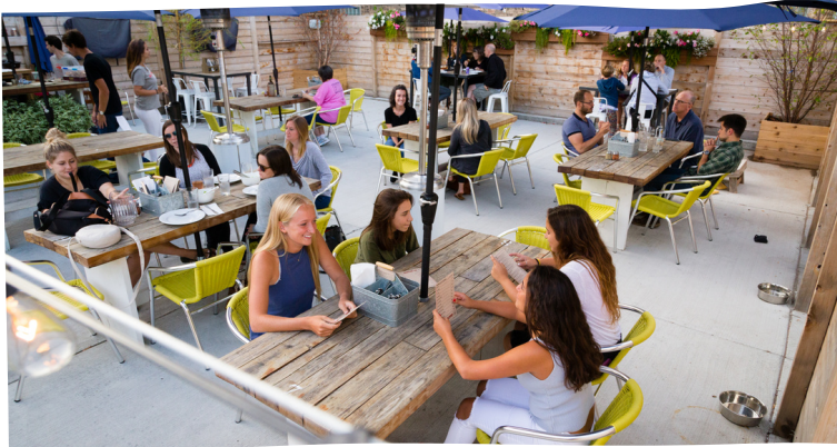
TABLE SEATING FOR 65 & 125 FOR COCKTAIL

Located just behind our quaint, 18 seat, double storefront on Chicago Avenue the beer garden design is casual & relaxing with large communal picnic tables, umbrellas, two fire pits. Privacy fences and flower boxes surround along with 2 trees for greenery & a bit of shade. Two fenced in bocce courts attached. Our neighborhood hideaway is a secret gem & the perfect space for your next gathering.